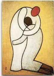
Lost and found